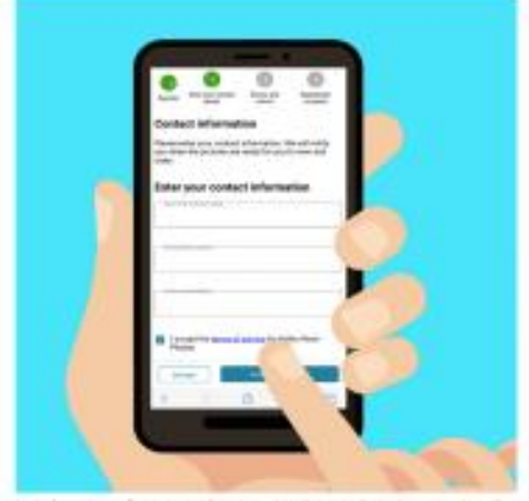
*This information will only be used for distribution of personal mage codes and ordering details

3 Fill in your contact details & review before confirming your registration*